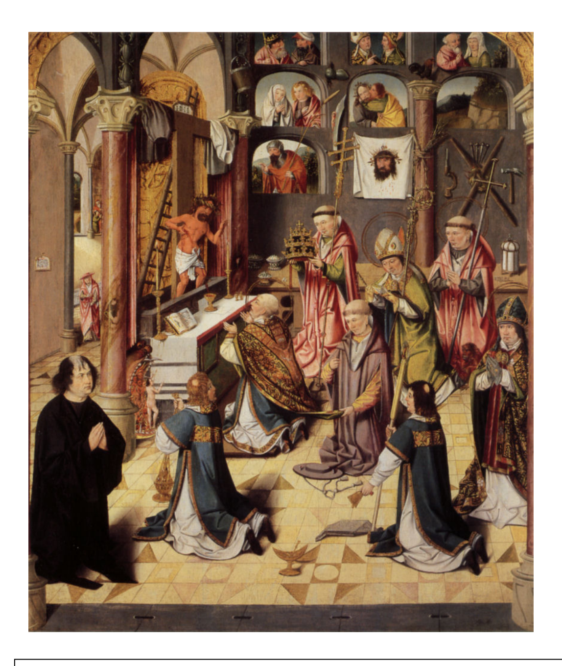
The Mass of Saint Gregory the Great, Northern Netherlands, c. 1500. Panel 92.1 x 78.1 cm. Museum Catharijneconvent, Utrecht.

The aim of MMR is to create greater publicity for memoria-research in the Low Countries. Readers are invited to inform us of news about congresses, publications, projects and other related subjects, so that these subjects may be included in our future issues. Please consult the colophon for the address to which to send your messages!